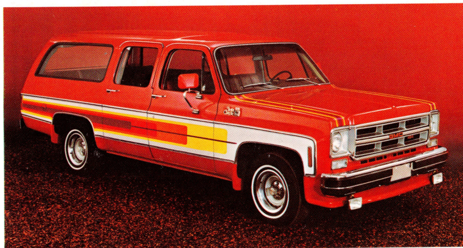
The Suburban shown here has red and white primary and white secondary color with an applique of yellow/red stripes.

able automatic transmission. Once you select the available equipment, you may order the Motortown Basic Appearance Package. With it you choose the multicolor applique you